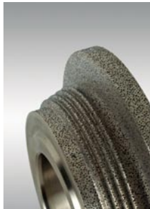
Single profile dressing wheel