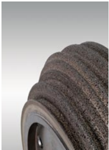
Multi-profile dressing wheel